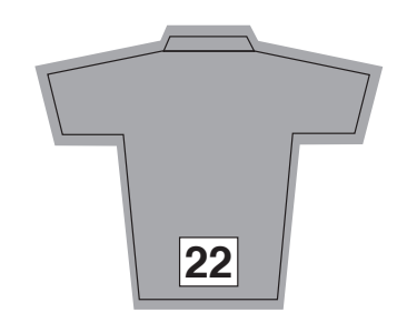
Photo finish will be used at this event. Please wear your numbers as shown. One number placed centre back of shirt or skinsuit – numbers should not be folded.